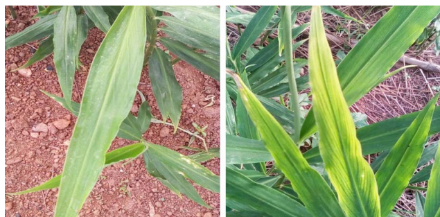
Fig. 1: Disease symptoms expression on ginger plants infected by WSMV: (A) healthy ginger leaf sample; (B) A typical WSMV disease symptom on young ginger leaves showing pale to yellow parallel interveinal streak and giving a mosaic pattern.

Data obtained on WSMV incidence were subjected to analysis of variance. Variation of means were considered significant at 5% level of probability using either least significant difference (LSD) or by plotting standard error of means as described by Gomez & Gomez (1984).