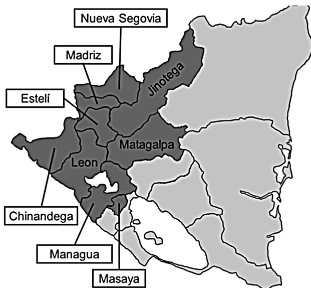
Fig. 3: Map of Nicaragua identifying provinces where data collection took place.

To collect qualitative data, key informant interviews and focus group discussions were held. Quantitative data were gathered through individual interviews using a structured questionnaire. Key informants (Table 1) were also interviewed with the aim of gaining a more profound understanding through a less structured conversation. The key informants in the different regions were chosen based on the different types of stakeholders involved in agricultural development: governmental organisations, non-governmental organisations, research institutes, universities, and private companies. The interviews conducted used a guide based on the individual survey and the conceptual framework.